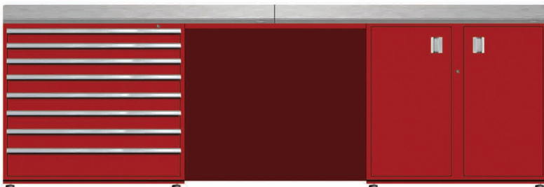
10' PARTS COUNTER

Versatile shelving solutions with endless configurations!