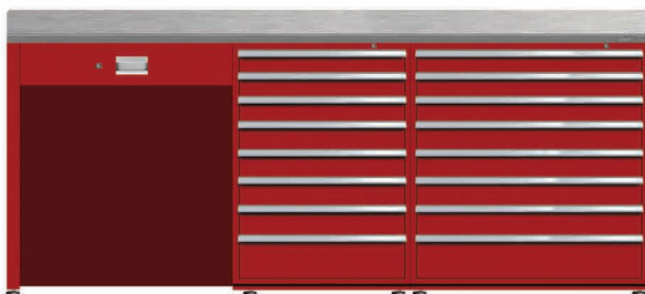
7' PARTS COUNTER