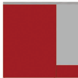
GLASS FRONT DISPLAY FOR MERCHANDISING