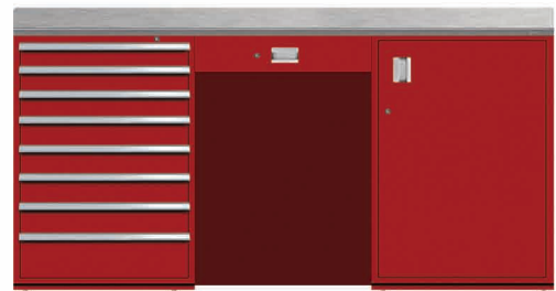
6' PARTS COUNTER