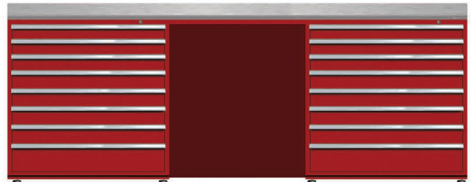
8' PARTS COUNTER